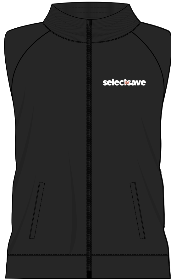
Gilet in Black with embroidered logo in White and Peach