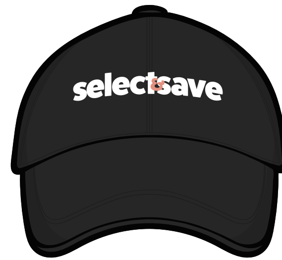
Baseball cap in Black with embroidered logo in White and Peach