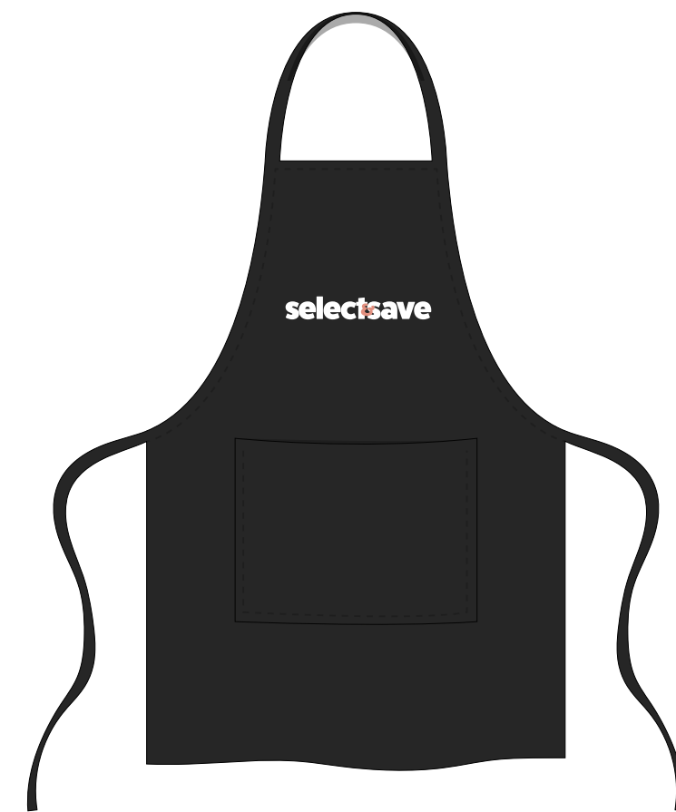
Short apron in Black with embroidered logo in White and Peach