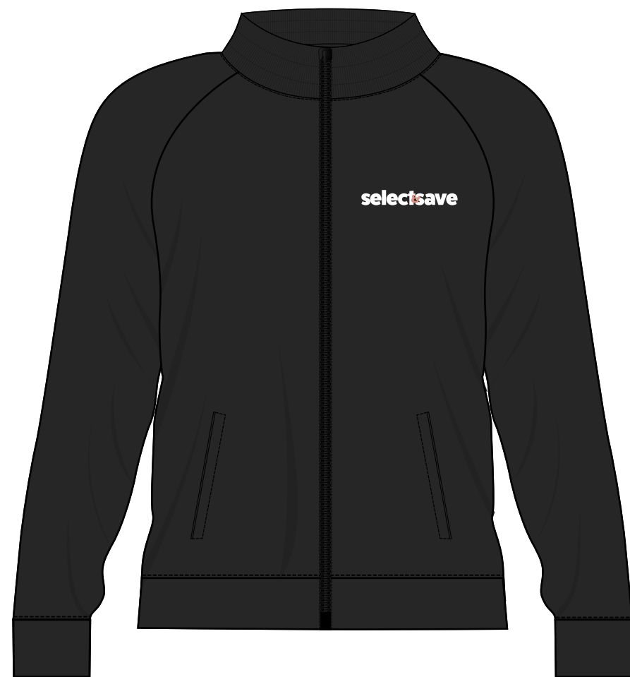
Long-sleeved fleece in Black with embroidered logo in White and Peach (front)