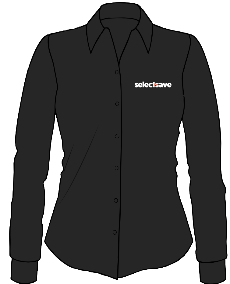
Women's poplin shirt in British Racing Green with embroidered logo in White and Peach