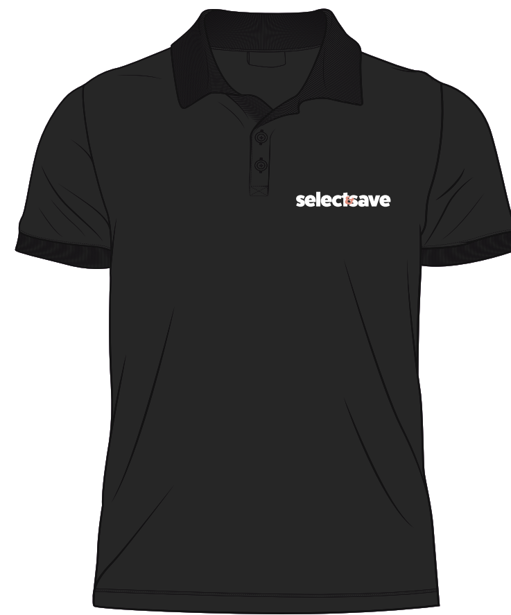
Polo shirt in Black with embroidered logo in White and Peach