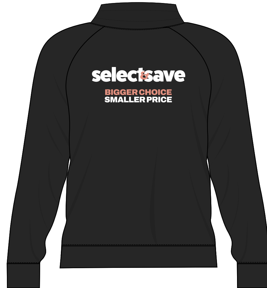
Long-sleeved fleece in Black with embroidered logo in White and Peach (rear)