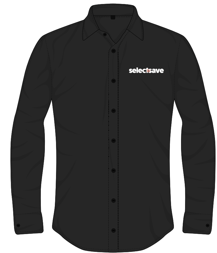
Men's poplin shirt in Black with embroidered logo in White and Peach